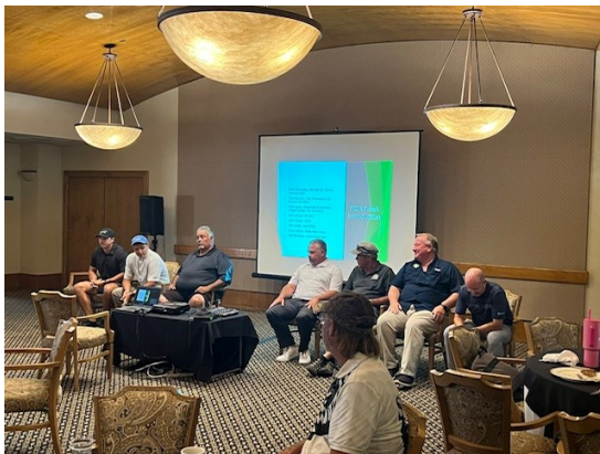
Above: Our esteemed panel, discussing all of the details on turf conversion and how to successfully manage it.