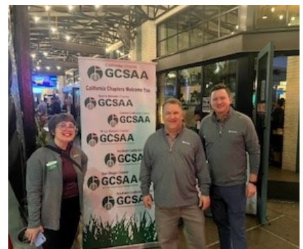
Above, some of the wonderful GCSA Staff members who graciously attended the event.