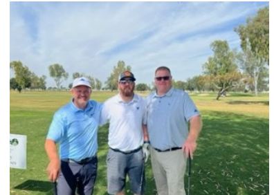
Thanks to Gavin Dickson with Grass Roots