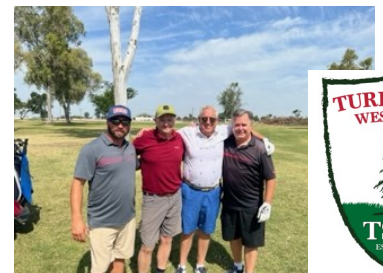
Thanks to Kevin Eppich and Turf Star for being our Beverage Sponsor