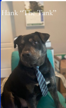
Hank "The Tank"

Good Day to everyone! I am please to interview this issues newest Dog Celebrity.