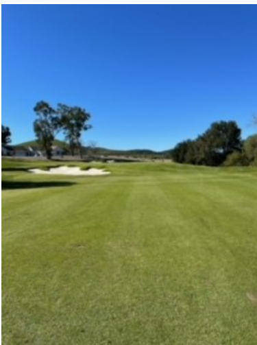
Fairway with new bunkers

I know there are a ton of other changes you might like to know about, but for now, we'll save that for another time.