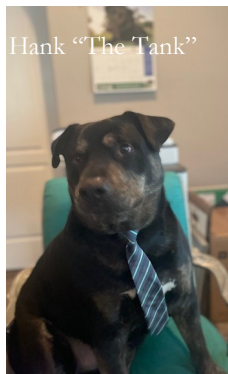
Hank “The Tank”